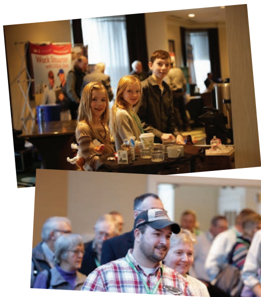
Exhibit for More Contacts